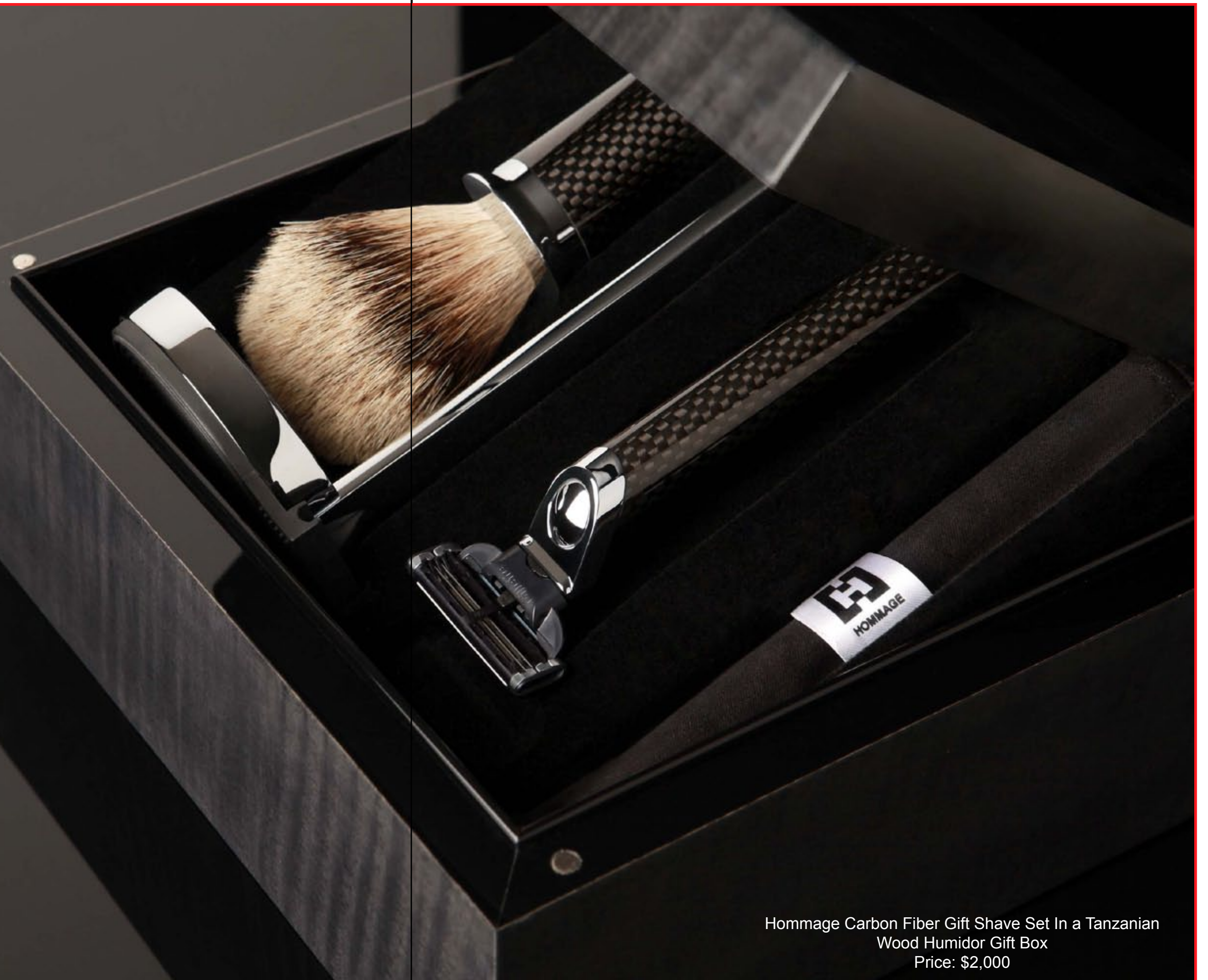
Hommage Carbon Fiber Gift Shave Set In a Tanzanian Wood Humidor Gift Box Price: $2,000